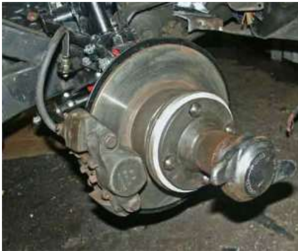
Right front disc brake assembly

Handbrake: conventional mechanical type, operating on rear drums via cables to a ratchet hand brake lever, mounted on the RHS of the transmission tunnel.