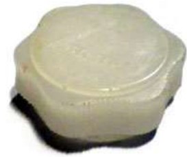
Master cylinder + different caps

Three different handbrake assemblies were used: