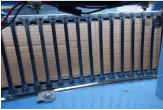
Early grille – slats individually riveted

Thereafter, from vehicle YGHN3/1930, the grille, including the slats, were made from one-piece pressed aluminium. (p/no. ARH 218). The fittings didn't alter.