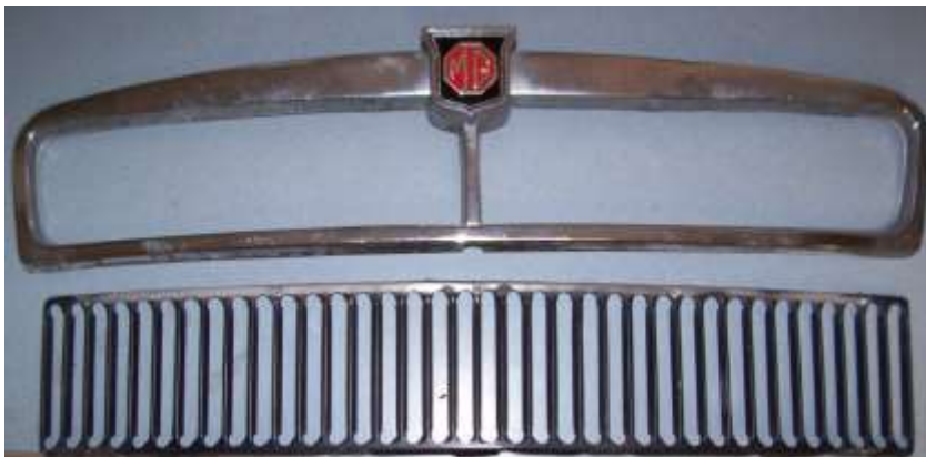
Later grille (Mk I & II). Grille made of pressed aluminium.

Thereafter, from vehicle YGHN3/1930, the grille, including the slats, were made from one-piece pressed aluminium. (p/no. ARH 218). The fittings didn't alter.