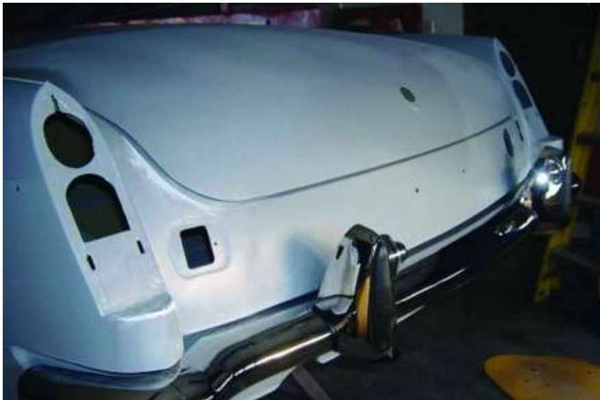
This photo shows the pressings made for the reverse lights

Pressed cut-outs for the inclusion of reversing lights (from car YGHN3/4487)(circa June 1967)