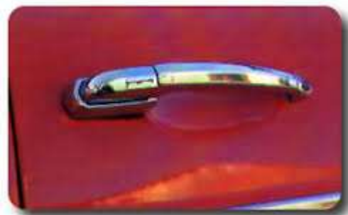
Early 'pull' handle c/f later 'push button'

The pull handle (p/no AHH6661 & AHH6662) was fitted to cars YGHN3 501 - 2268.