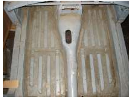
Figure 1 Early 3-sync tunnel c/f wider 4-sync tunnel. Compare the ribs on both sides to see the difference