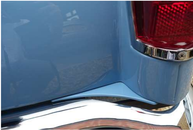
Early, large, painted bumper infill

On the early Mk I cars (YGHN3/501 – YGHN3/100), the infills between the rear bumper and the body (next to tail lights) were painted body colour.