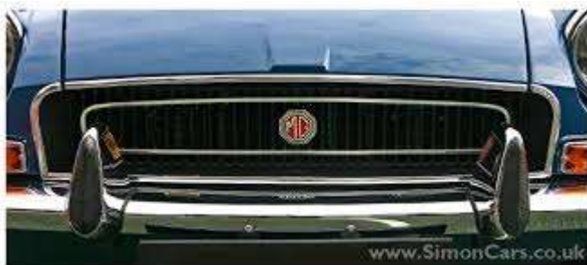
Mk II (facelift) grille

With the introduction of the Mk II (facelift), the grille changed its appearance; recessed black vertical slats with a 'D'-shaped chrome insert (laying on its back). In the centre was a new MG logo