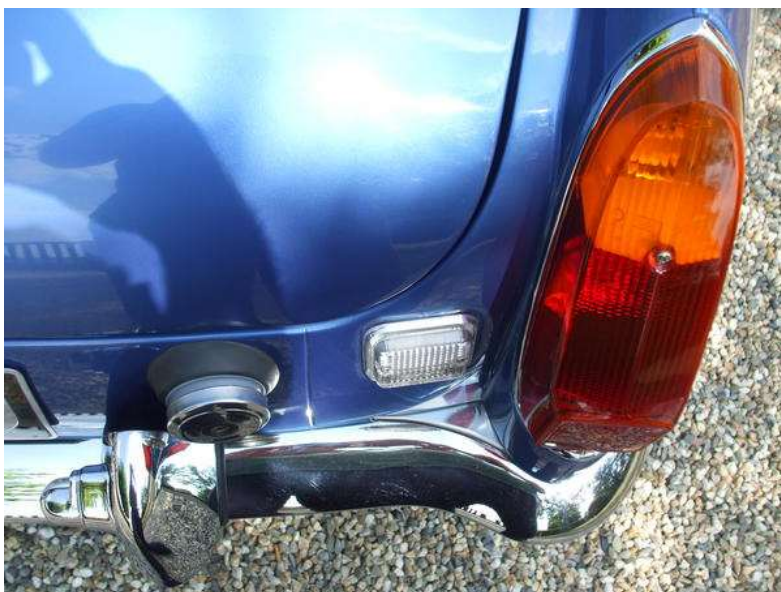
Later smaller bumper infill (polished alloy)

Thereafter (YGHN3/1001) they were smaller and polished aluminium.