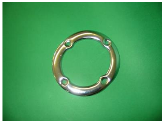
MkI gearshift surround c/f MkII gearshift surround

The gearboxes used on Australian-assembled MGBs went through three distinct variations (this would have been four if the assembly had continued past 1972)