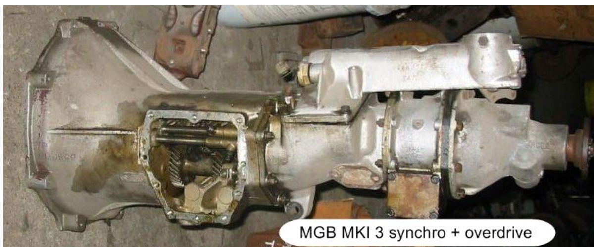
Mki-3 synchro + overdrive

The electric overdrive (on third and fourth gear) allowed for an 8% reduction in engine speed, saving fuel and reducing engine noise. As the position where the gear lever entered the body