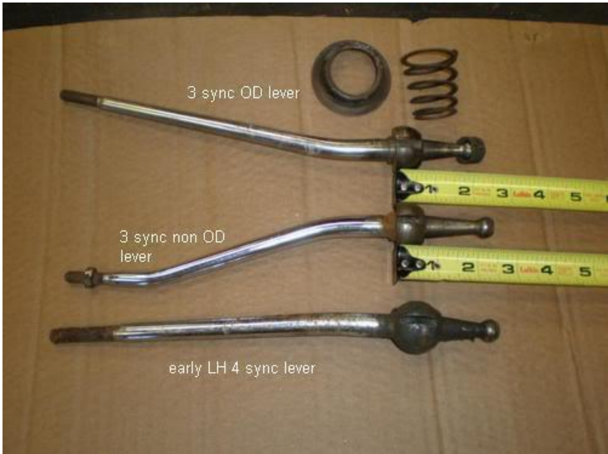
Different levers used

was different with either of the two configurations, the hole in the transmission tunnel was elongated to take either option. Due to the differing point of entry of the gear lever, it was necessary to fashion two different levers. The non-overdrive option, which entered the body further forward of the driver, had an obvious 'bend' in the lever, with the overdrive option sporting a 'straight' lever that entered rearward nearer the driver. These levers are not really interchangeable as they differ in shape at the other end (see photos).