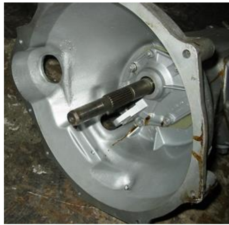
3-brg/3sync c/f 5-brg/3&4 sync

All of the above, along with the change that occurred in rear axles ('Banjo' to 'Salisbury') necessitated a change in drive shafts. These are detailed in the 'Driveshaft' section of this website.