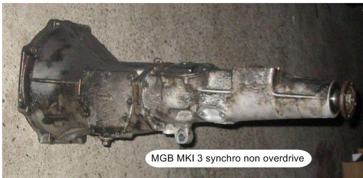
Mki-3 synchro/no overdrive

From the outset, the MGB was designed to accommodate a 4-speed gearbox with an optional overdrive (this option was not introduced in Australia until 1967).