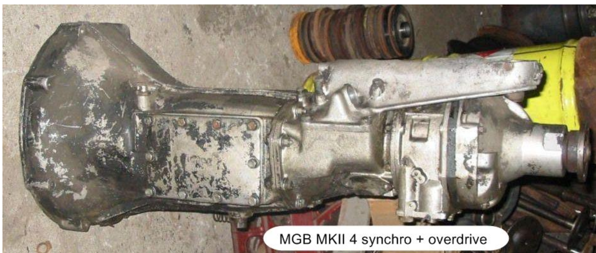
MkII-4 synchro + overdrive