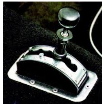
Borg Warner Type 35 Automatic gearbox and shifter