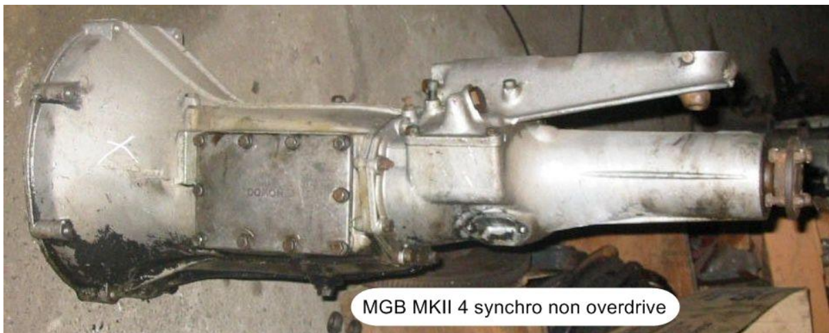
MkII-4 synchro, no overdrive

Note: A lot has been written about the 'narrow' tunnel (transmission tunnel) that was found on the early MGBs and modifications necessary to accommodate the overdrive unit. Whilst the hole was extended to allow for the rearward location of the gearshift lever, it is possible today to purchase fibreglass covers that simplify the modification.