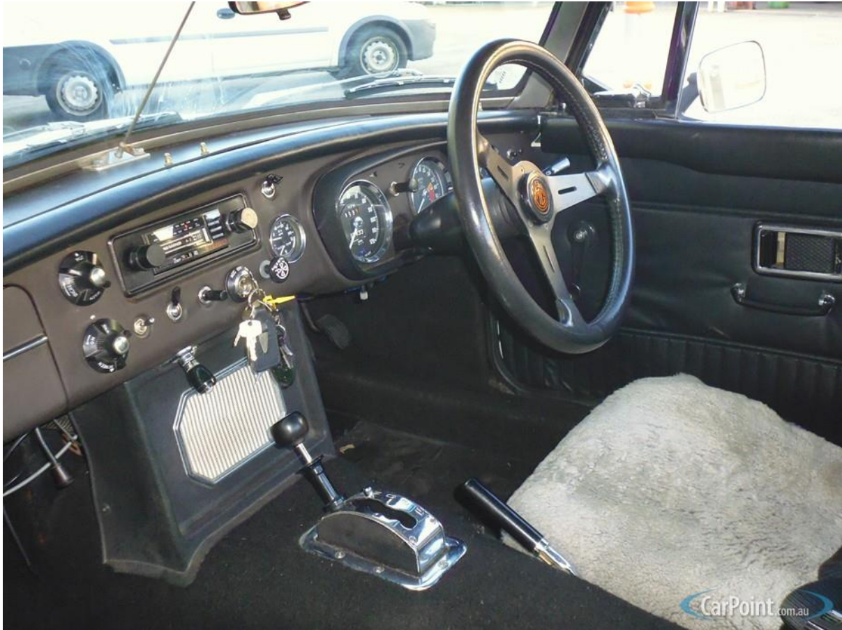
Photo showing automatic shifting lever and Lamp Assembly Gear Illumination