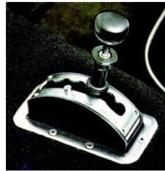
Borg Warner Type 35 Automatic gearbox and shifter