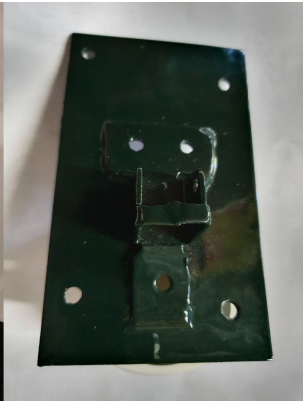
Catch plate welded to new plate