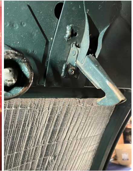
Attached to bonnet