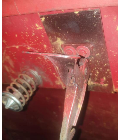
Attached to bonnet