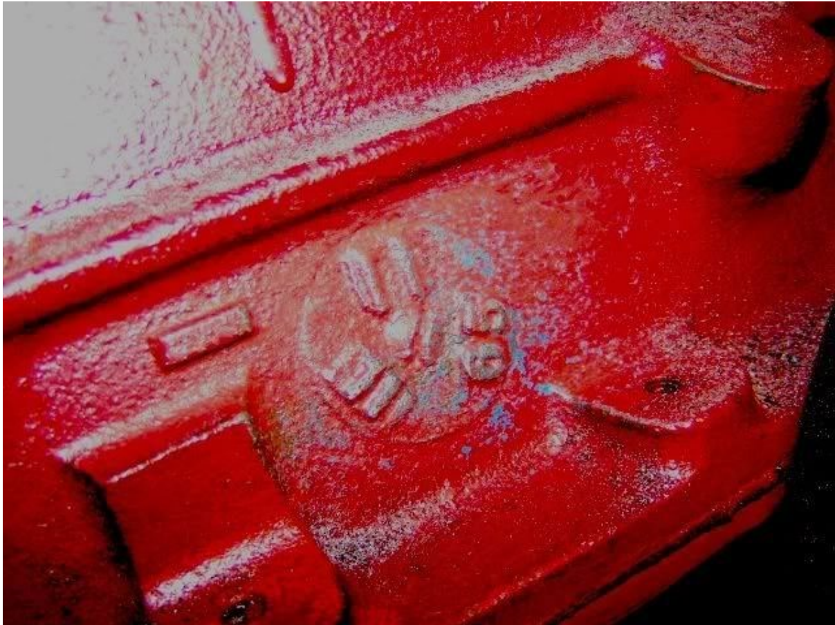
Build Clock (this engine - 11th Nov, '65)(12 o'clock position = day, 4 o'clock position = year, 8 o'clock position = month)